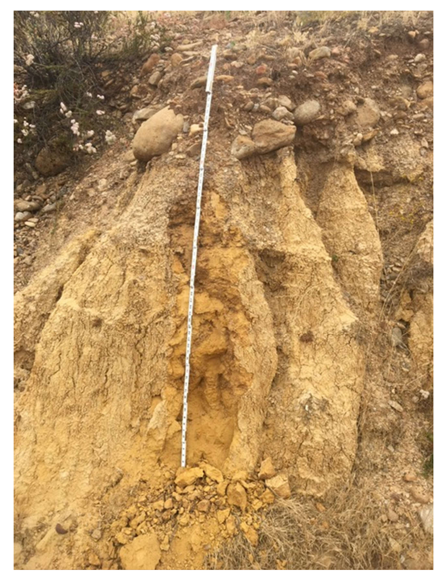
Figure 4. Eroded San Diego Formation outcrop and overlying colluvial deposits.