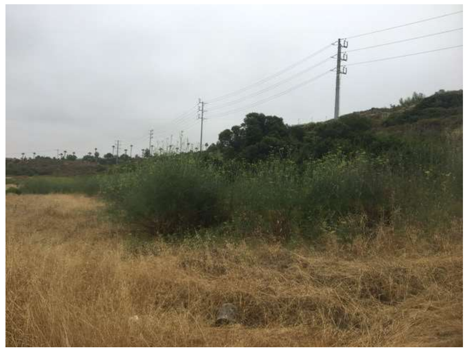
Figure 3. Photograph showing vegetation minimizing surface visibility.