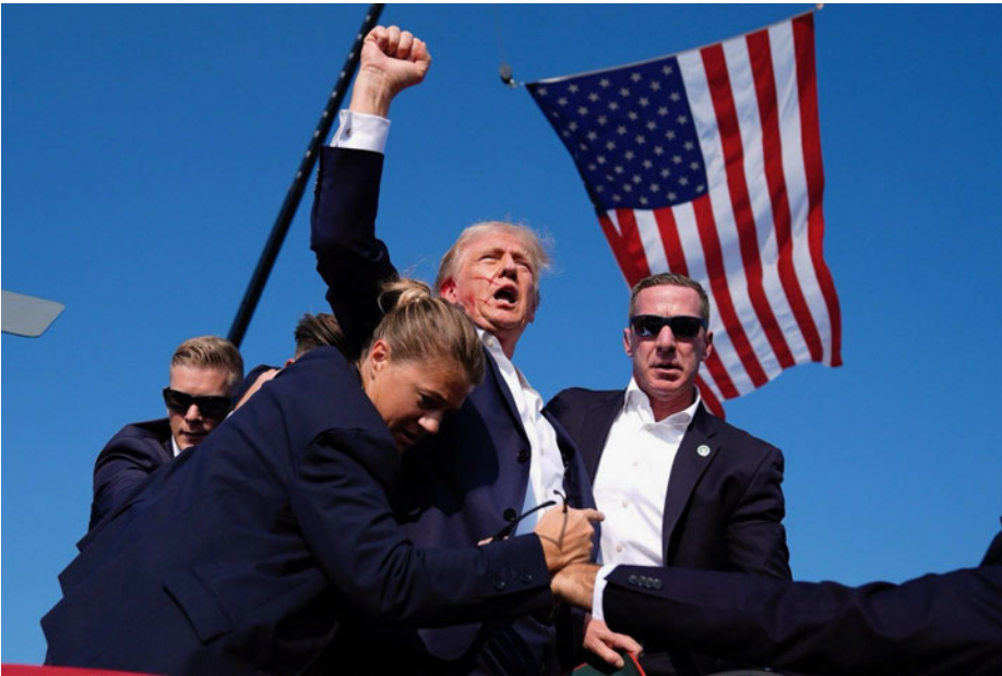
Republican presidential candidate former President Trump is surrounded by U.S. Secret Service agents at a campaign rally on Saturday, July 13, 2024 in Butler, Pennsylvania.