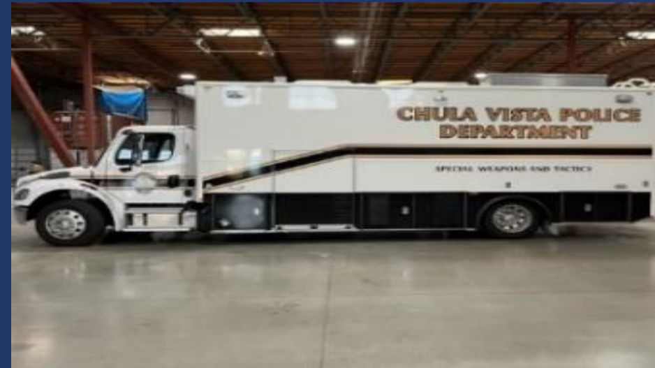
Freightliner M2 106 Chassis ( custom build )