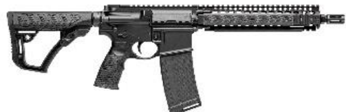
SWAT Issued Daniel Defense DDM4