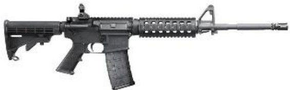
Patrol Issued Smith and Wesson MP15X