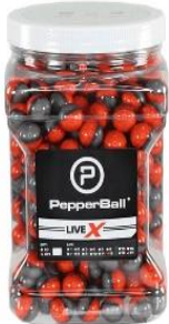
Pepper ball launchers (similar to commercial paintball guns)