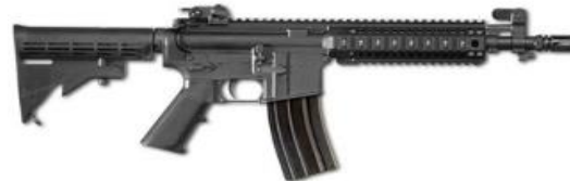
SWAT Colt M4 Training Only