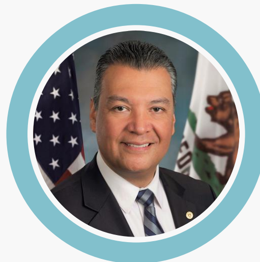
Alex Padilla U.S. Senate