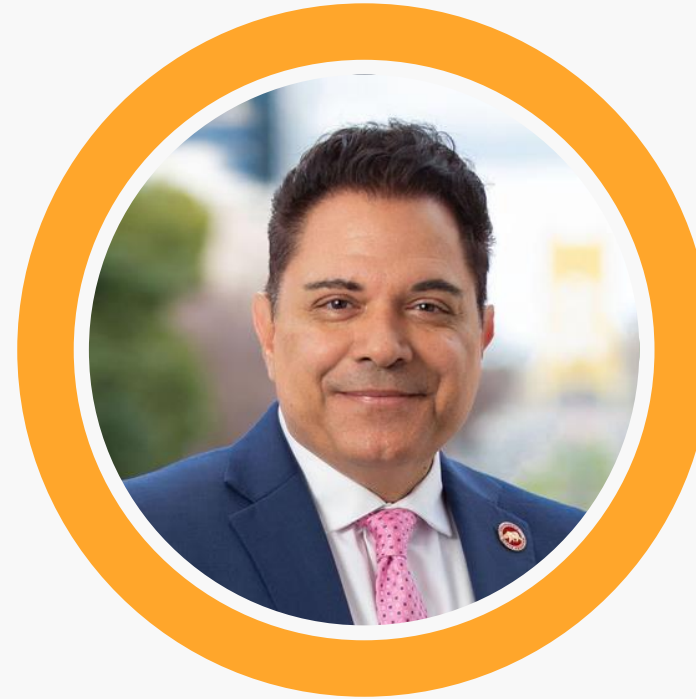
Senator Steve Padilla District 18