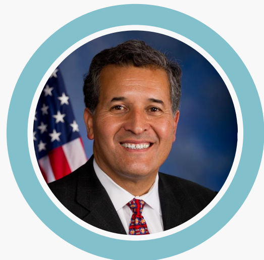
Juan Vargas U.S. House of Representatives District 52