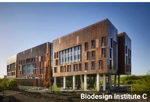
Biodesign Institute C