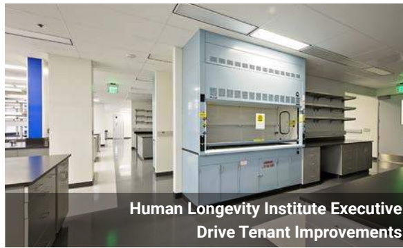
Human Longevity Institute Executive Drive Tenant Improvements