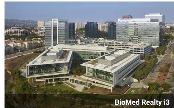
BioMed Realty i3