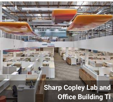
Sharp Copley Lab and Office Building TI