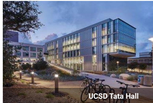
UCSD Tata Hall