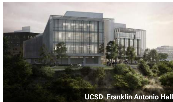
UCSD Franklin Antonio Hall