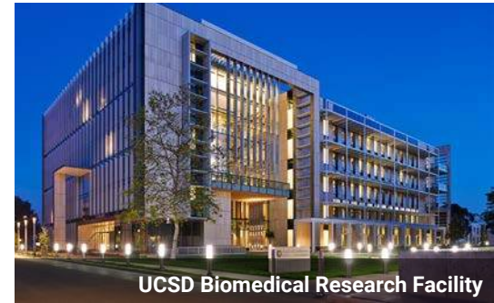
UCSD Biomedical Research Facility