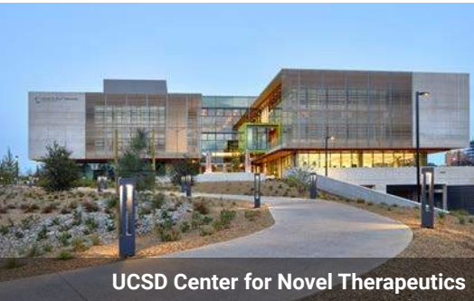
UCSD Center for Novel Therapeutics