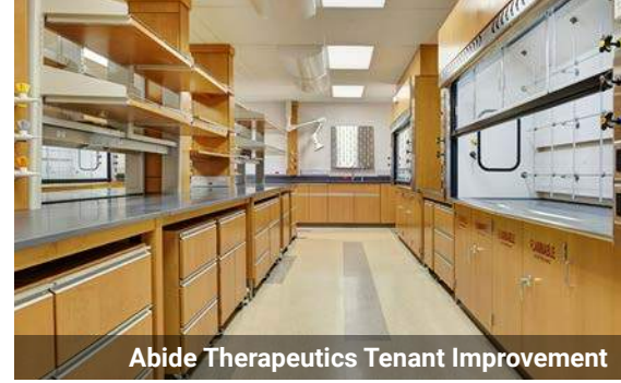
Abide Therapeutics Tenant Improvement

The projects highlighted on the following pages represent the depth of experience that McCarthy has across market sectors, project types and delivery methods.