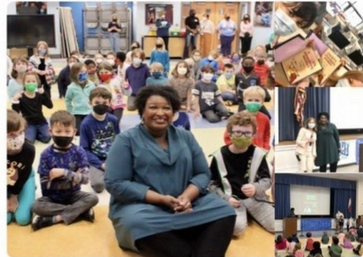
5:11 PM - 4 Feb 2022 5:11 PM - 4 Feb 2022