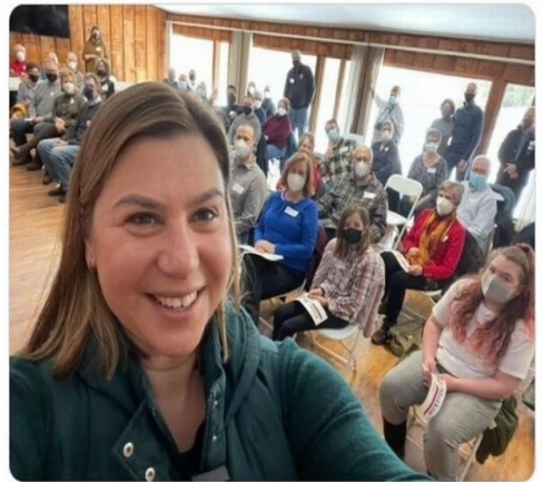
3:29 PM - Feb 6, 2022 - Twitter for iPhone

Another successful Snow Boots on the Ground event in Owosso! Thank you to everyone who came out despite the frigid temperatures. (My selfie skills also seem to be improving so my team actually let me post this one!)