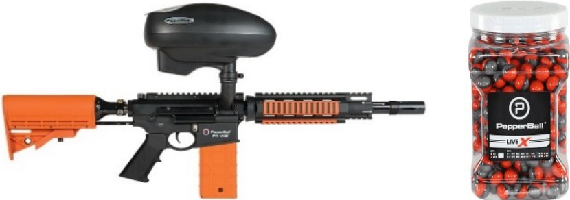
Paintball launchers (similar to commercial paintball guns)

The Department has utilized less lethal launchers since the early 2000's.