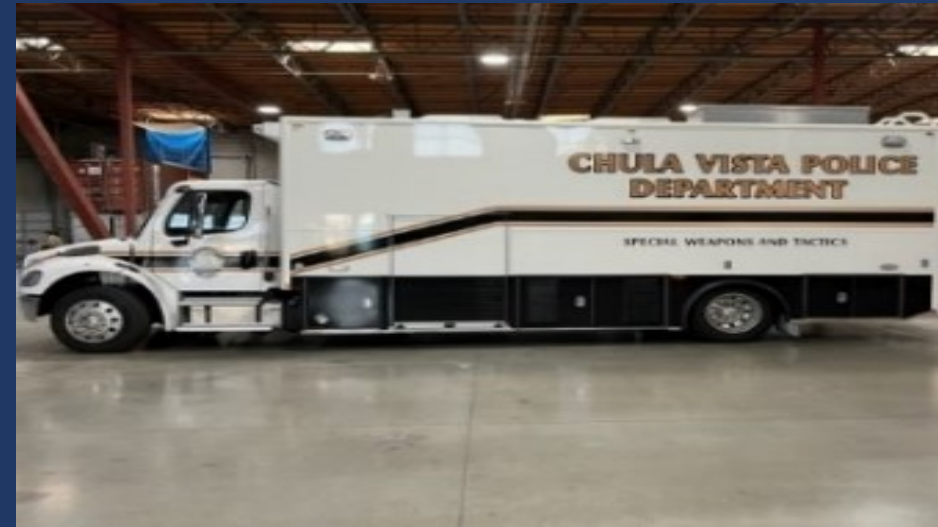
Freightliner M2 106 Chassis ( custom build )