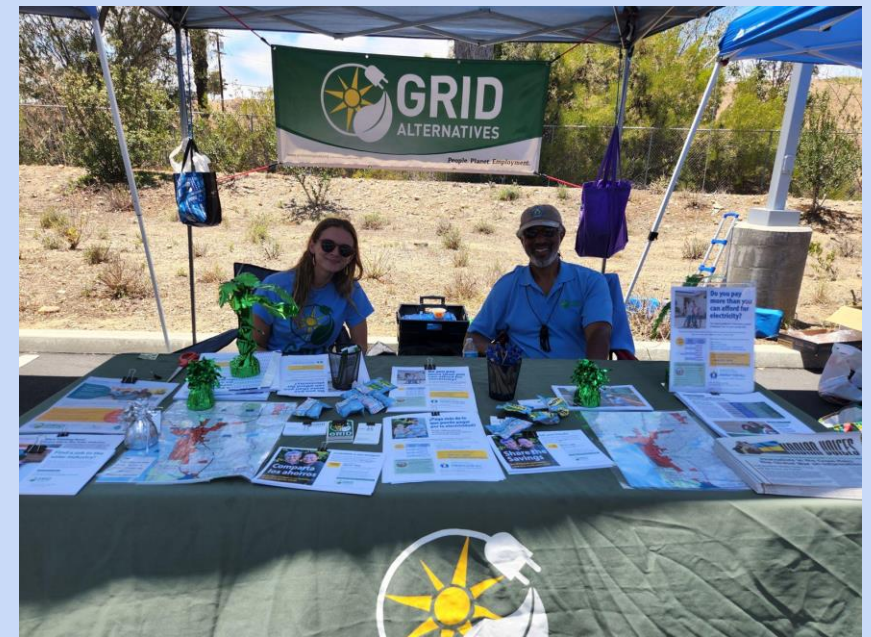
Health & Resource Fair @ Jackie Robinson YMCA