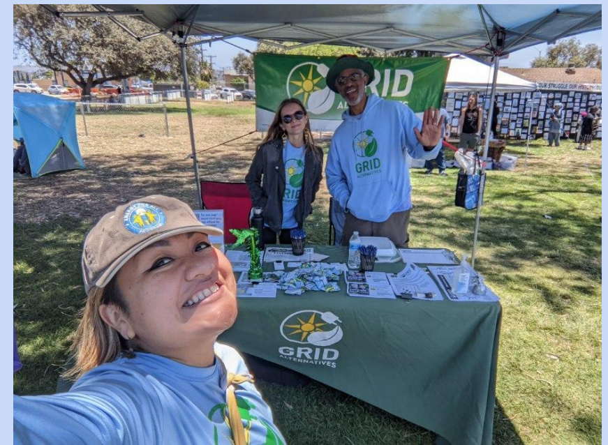
2022 Juneteenth Celebration